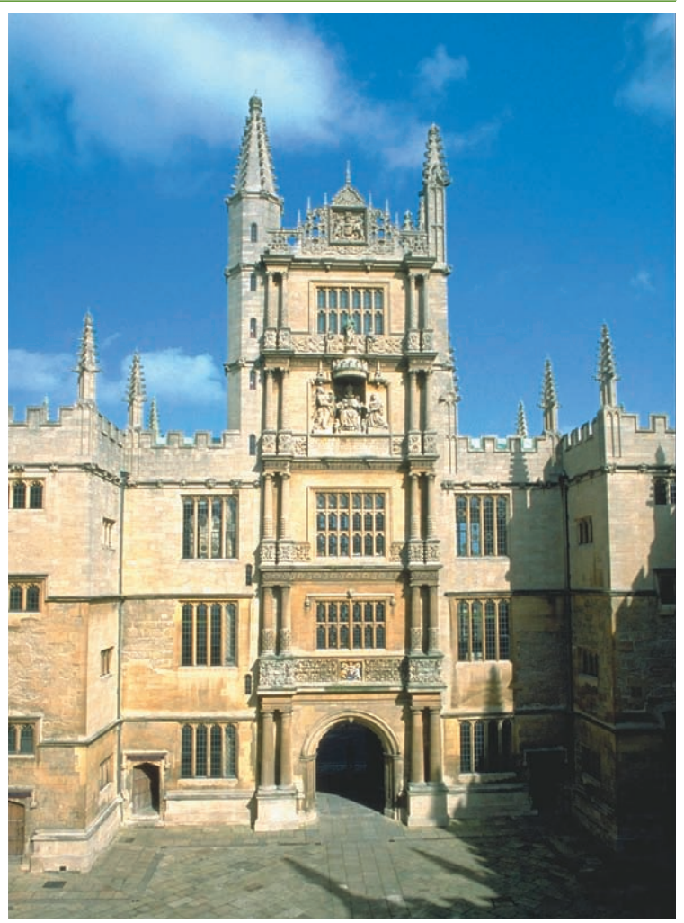
Bodleian Library, Oxford University

The third initiative is the final step in the move to CMI's new quarters at One Bow Street—the outfitting of its "back space" for lectures and workshops, now named the Hilbert space. The first use of the Hilbert space was on November