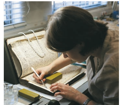
Book conservation at the Bodleian.

Attendees will receive a facsimile of selected parts of the manuscript, which will play an important role in the program. To open the conference, noted Oxford paleographer Nigel Wilson will discuss in detail two pages of the facsimile. With him, we will see what can be learned from a close reading of an original manuscript. For more information, including hotel accommodations and registration, see www.claymath.org/euclid .