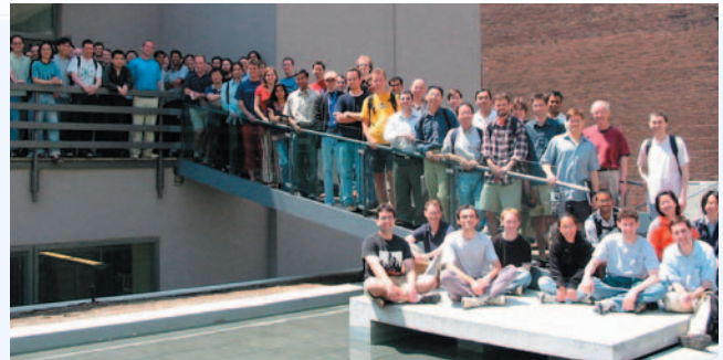
Fields Institute Summer School participants.

Mathematics is an international language. Students attending came from universities in Canada, the U.S., France, Austria, Israel, Italy, Germany, Holland, Hong Kong, the UK, and China. Their countries of origin were still more varied, including India, Iran, Korea, Macedonia, Peru, Romania, Pakistan, Turkey, and Vietnam.